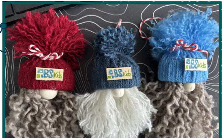
TN is feeling festive with these cute ABSKids gnome ornaments!!