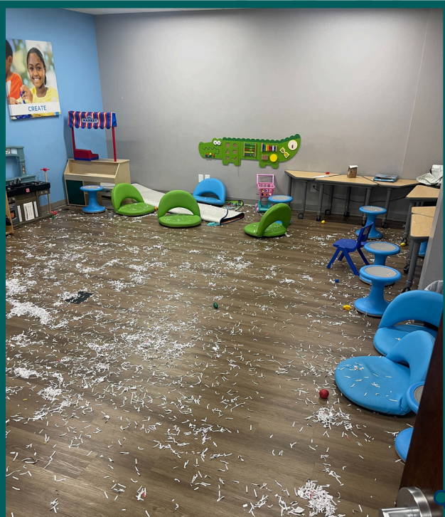
Snow Party at our Charlotte Billingsley Center

We're proud of the impact these new centers are already making and look forward to further expanding our services in 2025.