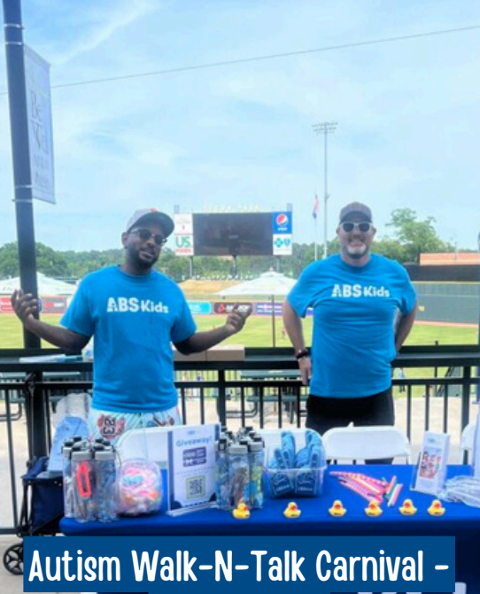
Autism Walk-N-Talk Carnival - Columbia, SC