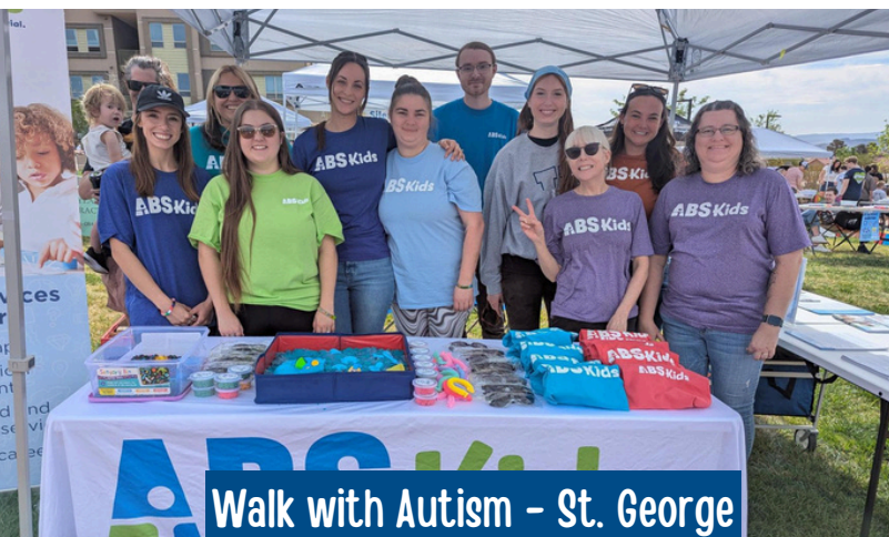
Walk with Autism - St. George