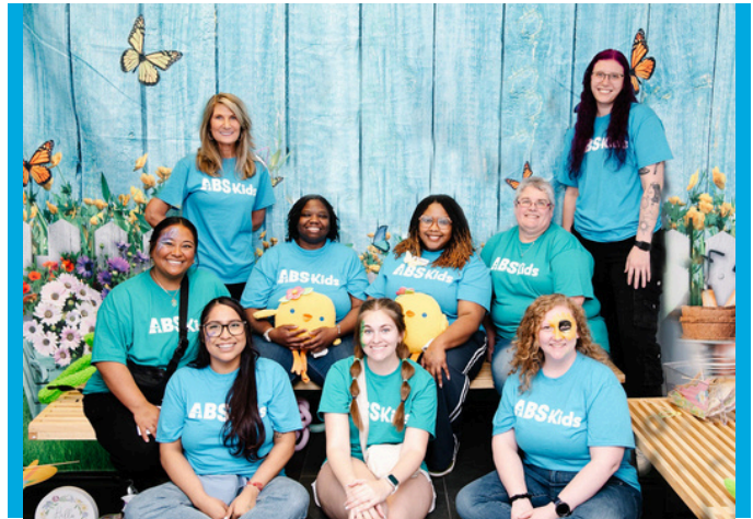
Greenville, SC Grand Opening