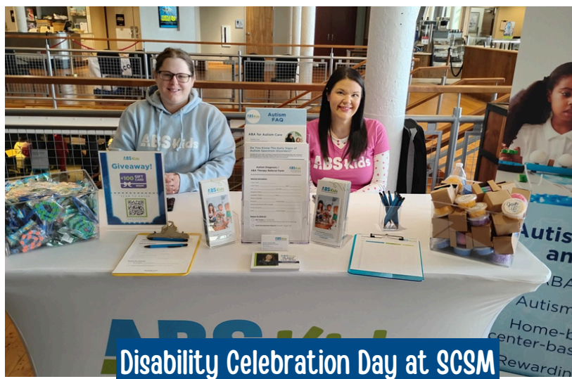
Disability Celebration Day at SCSCM