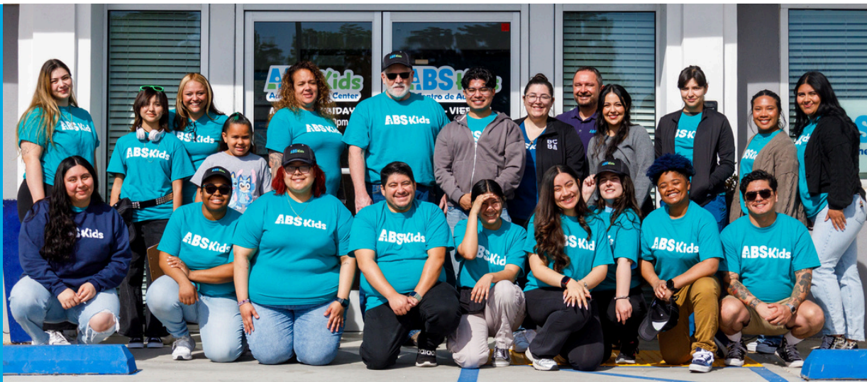
Chino, CA Grand Opening Sensory Friendly Swing into Spring