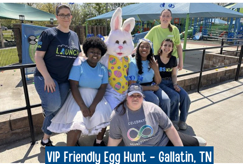
VIP Friendly Egg Hunt - Gallatin, TN