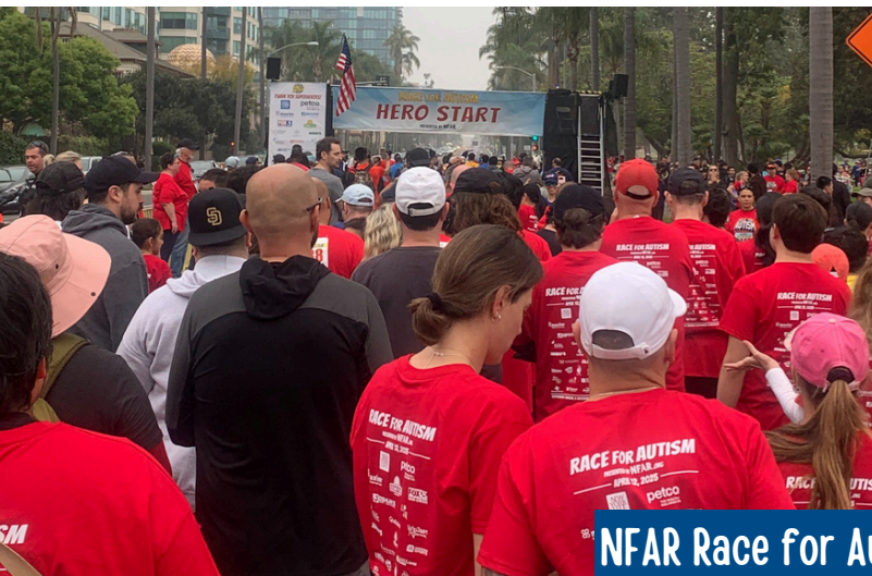
NFAR Race for Autism - San Diego, CA