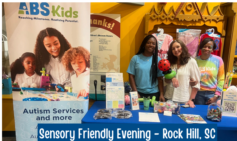
Sensory Friendly Evening - Rock Hill, SC