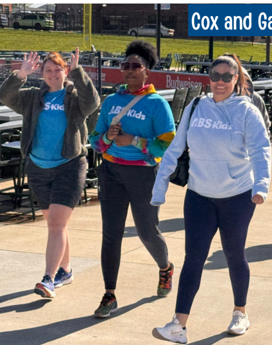
Cox and Garrison Centers at AJ Autism Awareness Walk!