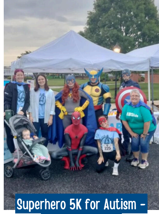
Superhero 5K for Autism - Fountain Inn, SC

Sensory Friendly Swing into Spring - Raleigh, NC 16th Annual Walk with Angels - Lehi, UT