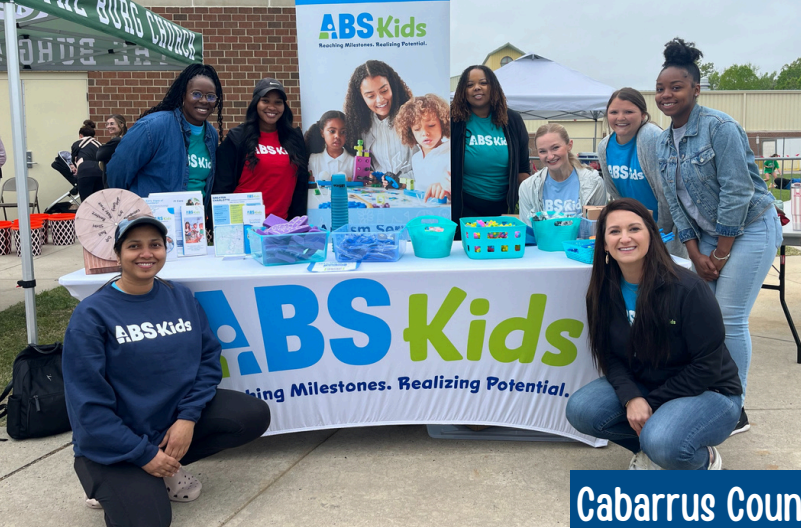
Cabarrus County Spring Games