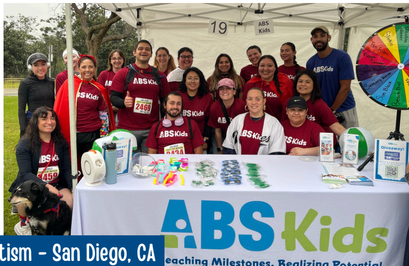
Reaching Milestones. Realizing Potential.